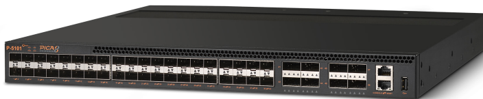
Figure 3. Pica8 P-5101 OpenFlow switch

In the exemplary deployment, there are three spine switches and three leaf switches co-located with the analytics server cluster and the controller machine in a data-center-like environment. The spine switches and the leaf switches are interconnected in a Clos network topology, prepared for future expansion of the network. The switches are Pica8's P-5101. They are the typical 1RU Broadcom Trident 2-based switches, but most importantly, they are driven by PicOS. The controller talks to PicOS using the standard protocol OpenFlow 1.3. A P-5101 switch provides four 40GE ports and forty-eight 10GE ports. LTV8250 devices are connected to the spine switches through the 10GE ports. The 40GE ports are used for interconnecting the spine switches and the leaf switches. The 10GE ports of the leaf switches are used for connecting to the servers. The management ports of the switches are connected to the controller machine through an out-of-band Ethernet network.