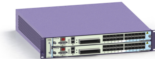
Figure 2. LTV8250 packet broker

LTV8250 is a 100GE packet broker. The 2RU device provides two 100GE interfaces and twenty-four 10GE interfaces. One of its functions is to convert the 100GE tapped traffic into 10GE traffic towards the spine switches of the fabric. It also supports 128K filtering rules for selecting or de-selecting specific packet flows to be forwarded to the analytics tools. An important one of its functions is to ensure that a conversation of two end-nodes, i.e., traffic from IP A to IP B and vice versa, always lands on the same instance of an analytics tool through the fabric so that the traffic analysis can be most effective. The packet brokers are located at the traffic extraction points.