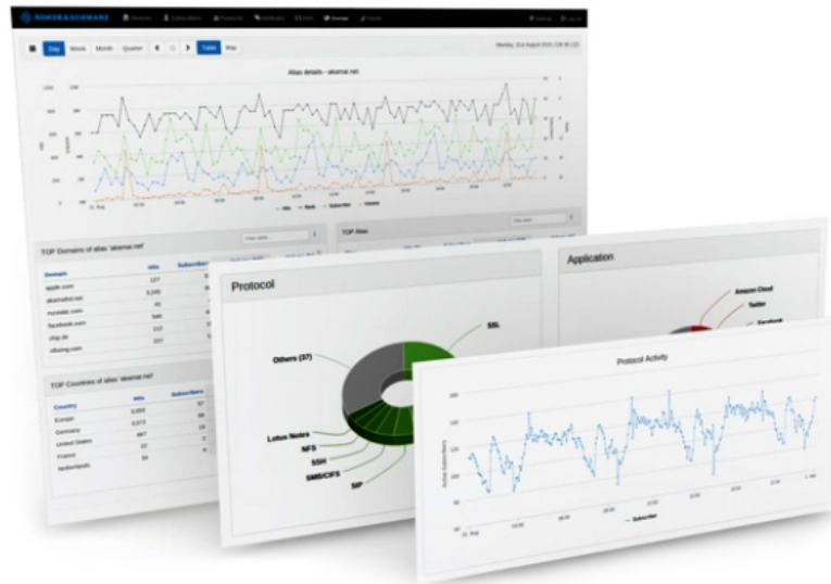
Figure 5. Reports of Net Reporter.